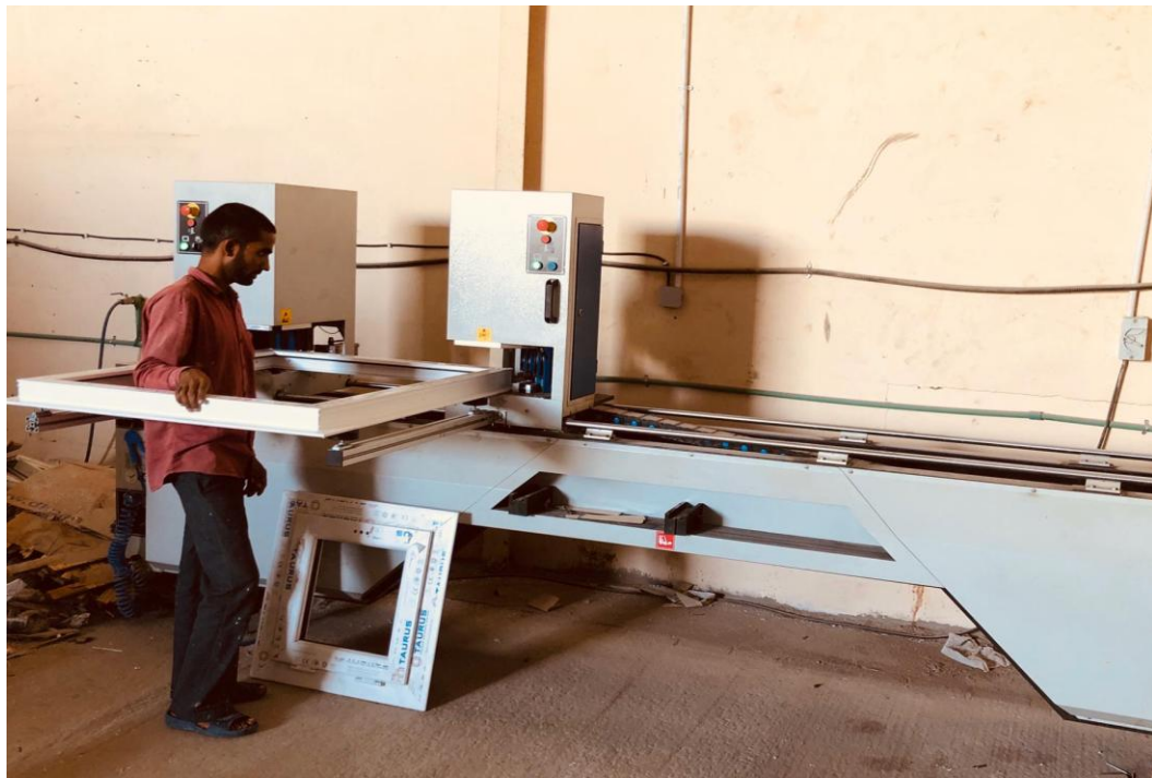
OMRM 112 Automatic Double Head Welding