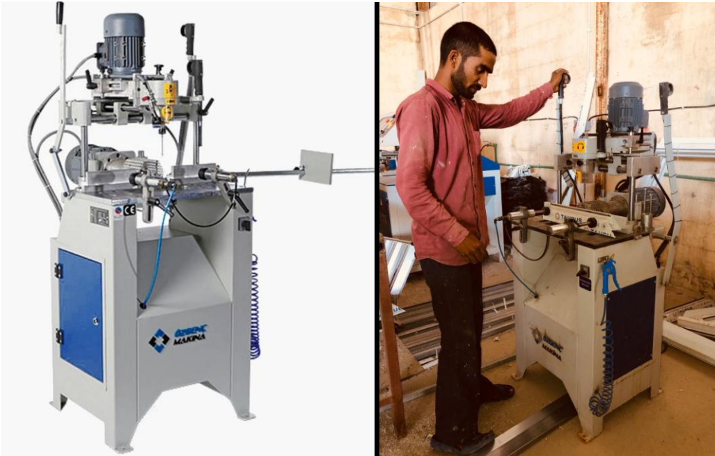
OMRM 117 Copy Router With Triple Hole Drilling