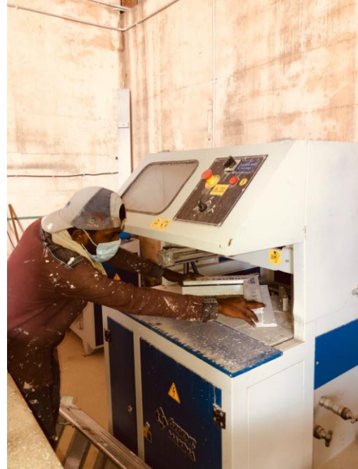
OMRM 114 Automatic Corner Cleaning Machine ( Fast Changing Blade )