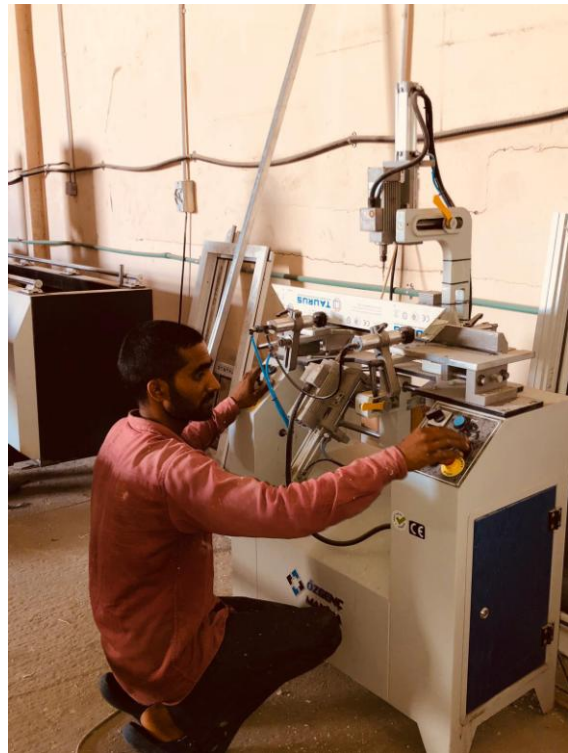
OMRM 116 Automatic PVC Profile Water Slot Drilling Machine