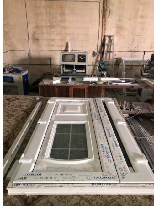
OMRM 121 Automatic End Milling Machine