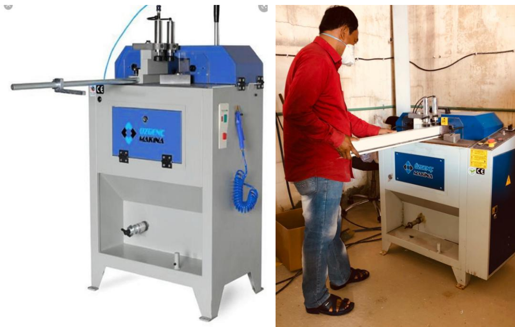
OMRM 121 Automatic End Milling Machine