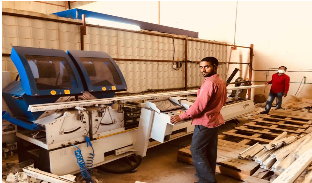
OMRM 113 Automatic Double Head Cutting Machine ( PC Control Unit & Barcode Printer )